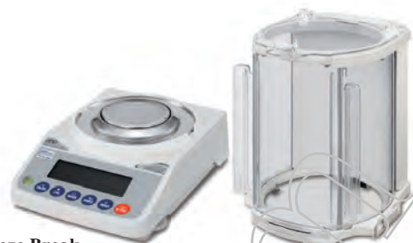
Removable Breeze Break

The breeze break is treated with an antistatic agent to ensure stable weighing. It also offers a large working space and can be detached for better portability and easy cleaning of the balance.