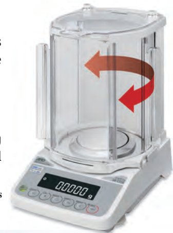
Rotary Sliding Doors

The breeze break is easily removed using a unique clip system, allowing fast, simple cleaning and use in confined spaces like gloveboxes and controlled environment cabinets.